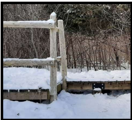
You Found me (Golden Rod Gall)