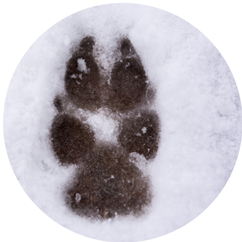
2 different sizes of animal track