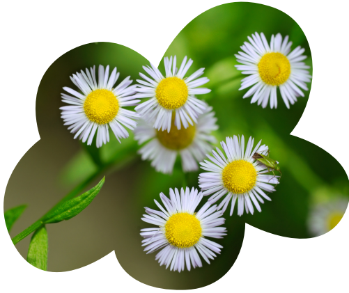
White flowers, 3 types