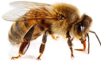
A flying insect