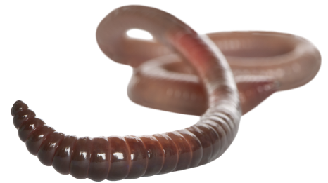
2 different earthworms