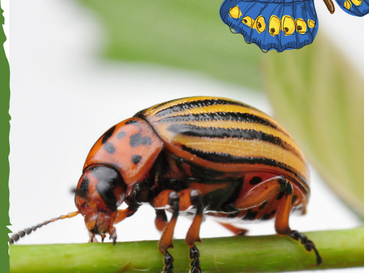
A crawling insect