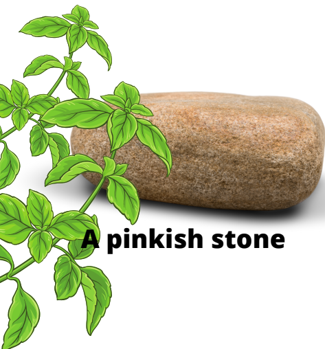
A pinkish stone