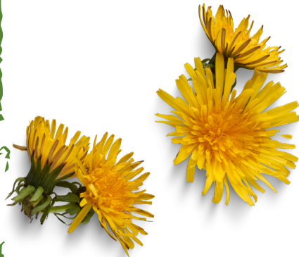
Yellow flowers, 3 types