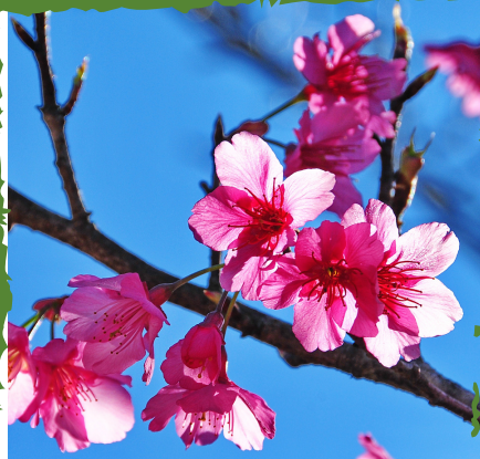
3 flowering trees: same/ different kinds